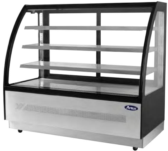
Four Tier Upright Curve Cake Showcase