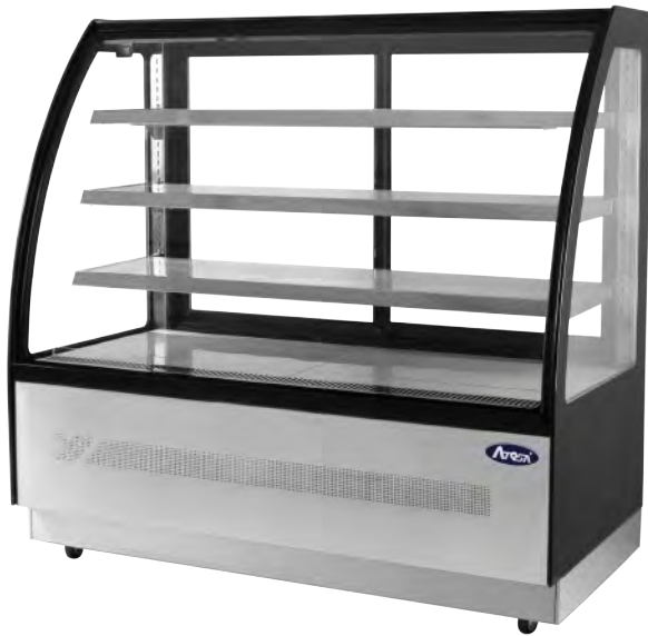
Four Tier Upright Curve Cake Showcase